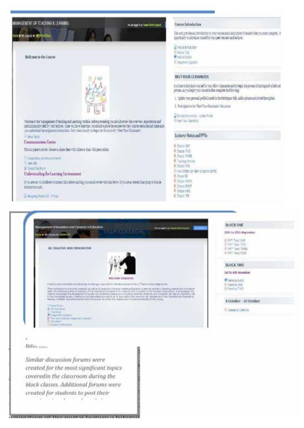
Figure 1: Screenshots of the student portal

The common structure presented for each module on the portal does not include many communicating tools that are already available. The only communication tools provided for each module are the news forum, chat room and the assignment upload link (refer to Figure 1). The only interaction is done via chat sessions where all the students need to be active at the same time (synchronous communication). This structure does not enable the students to be more active and participate through interactive discussion on their own flexible timing. Students rarely use the structure other than to participate in a chat sessions conducted once in a while and to upload their assignments.